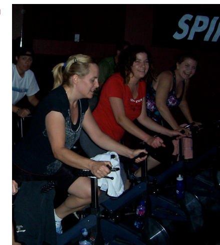
Spinning at Synergy Total Fitness

On March 6th, Northland Family Help Center (NFHC) held its 2nd annual A Healthy SPIN on Life fundraiser at Synergy Total Fitness to raise money for our programs and cultivate awareness about healthy relationships. The event was an indoor cycling ride (spinning), and individuals and teams collected donations of one dollar for every minute they rode. The cycling was loads of fun, and the spinners raised almost $4,000 for NFHC programs!