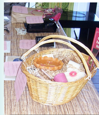
Prizes donated by local businesses