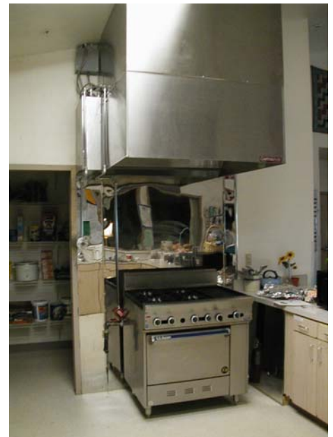
New kitchen ventilation hood