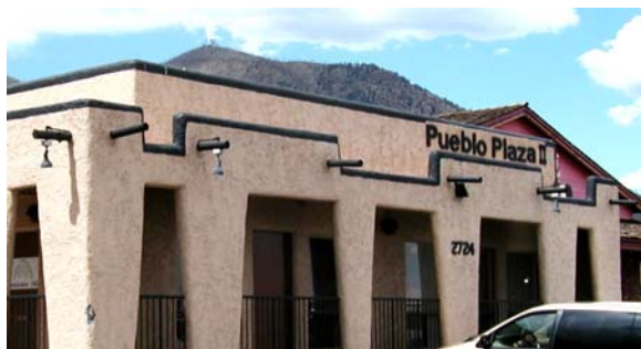
2724 E. Lakin Dr. #7